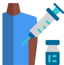
Proper Injection Technique

Your healthcare provider will educate you on appropriate insulin use.