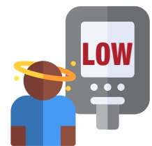
Recognition and Treatment of Hypoglycemia