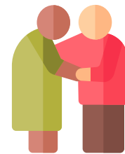
your treatment goals