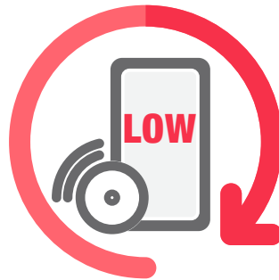
Frequent low blood glucose