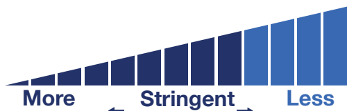
Your clinician may loosen your glucose targets