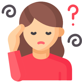
Difficulty following treatment plan